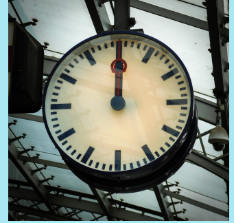
Pray it at 6, 12 & 6pm